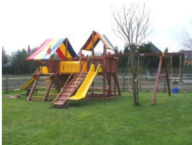
Our bespoke play equipment in the garden

Smisby Day Nursery and Smizkids 511 open from 7:45AM until 6 PM Monday to Friday. We are closed on all bank holidays and also for a week at Christmas, to include Christmas Eve.