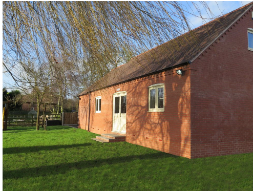
The new Smizkids building

All Food is cooked daily on the premises and the nursery has an important role to encourage healthy eating. The nursery is careful to plan well-balanced meals and snacks. All specific dietary requirements are catered for and we are increasingly catering for children with specific food intolerance's and special dietary needs.